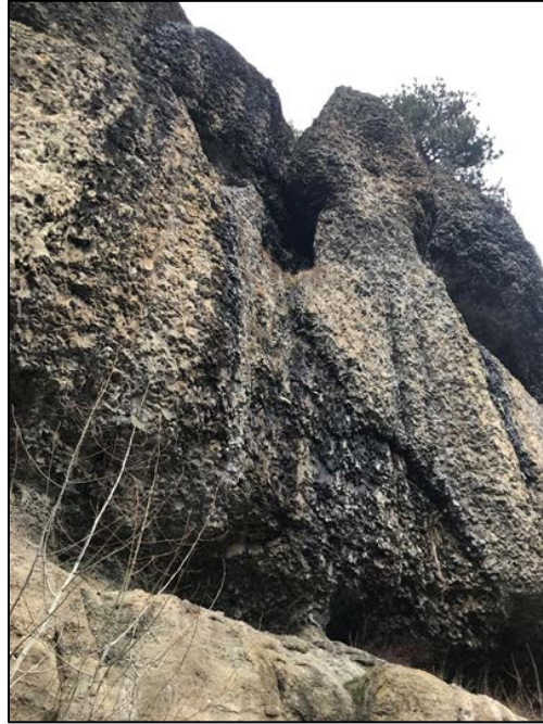
Location where two cougars were found after they fell from this cliff

Cougar Fall: A local resident on a walk noticed a dead cougar on the edge of a road and notified WDFW. Officer Nasset and Conflict Specialist Wetzel located an adult male and subadult female cougar. Both appeared to have fallen off a cliff during a fight.