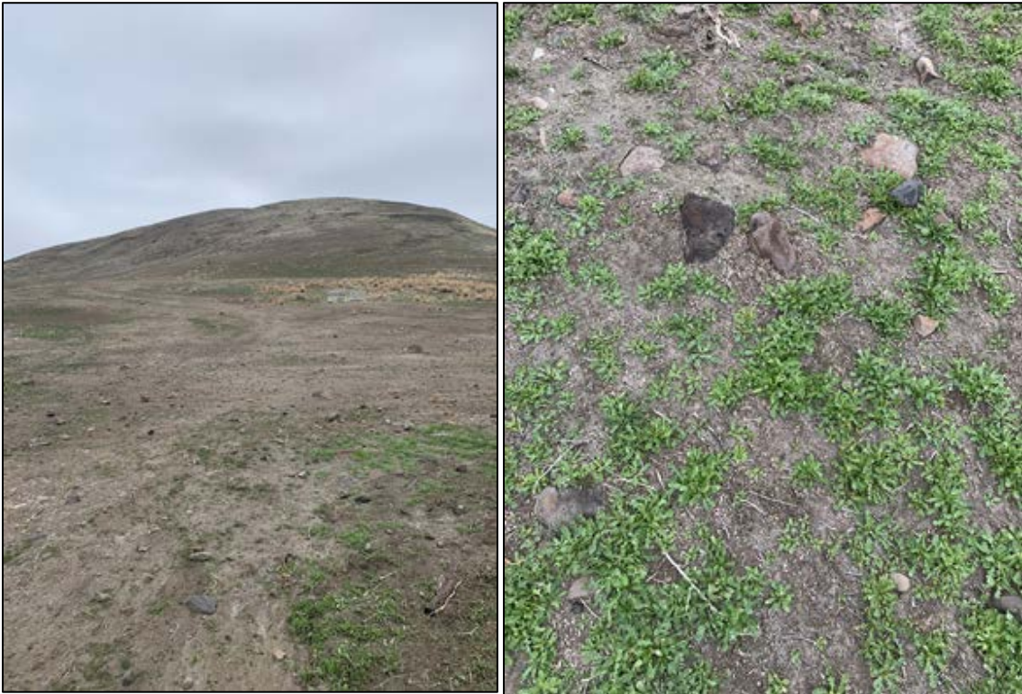
Hell's Kitchen restoration site on the Whiskey Dick WLA: pre-spray and seeding