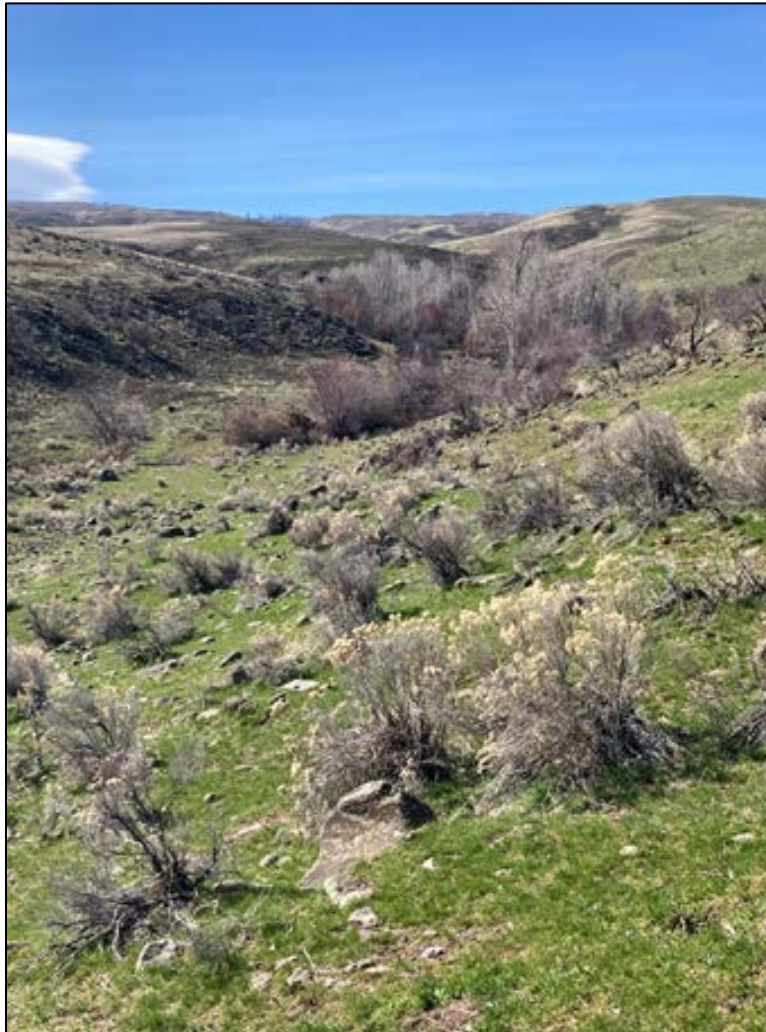
Hoover Acquisition to be added to the Wenas Wildlife Area early Summer 2022