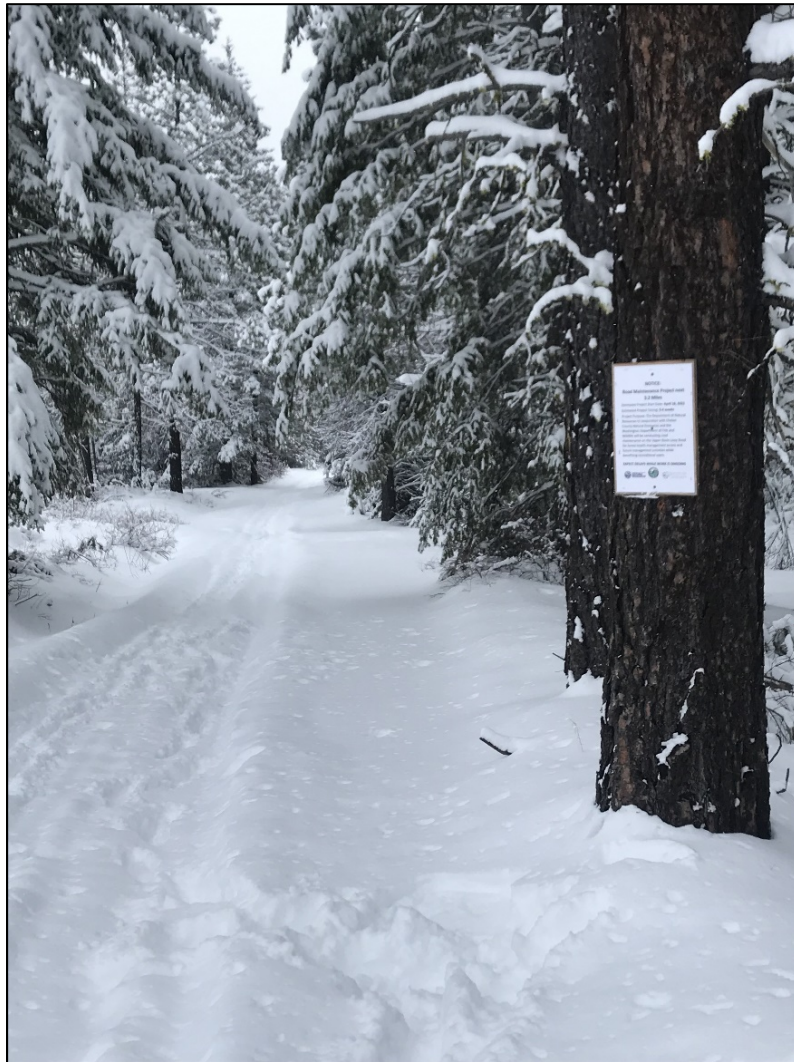
Signs posted on the Upper Basin Loop Road alerting public to “imminent” road improvement work, Colockum Wildlife Area

Colockum Wildlife Area Road Maintenance: WDFW has been coordinating with the Department of Natural Resources and the Chelan County Natural Resources Department on upcoming road improvement work. The Department Of Natural Resources is planning a timber harvest in the Stemilt Basin and will be upgrading roads across WDFW and Chelan County ownerships to be used as log hauling routes. The road work was scheduled to begin April 18, but the recent late snow has pushed that back. Assistant Manager Hagan did print and post signs alerting the public to the upcoming road work.