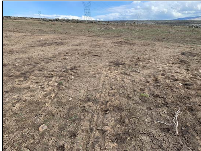
23-acre Vantage Highway Fire restoration

Vantage Highway Fire Restoration: L.T. Murray Wildlife Area Assistant Manager Winegeart evaluated the 23 acres that burned during the Vantage Highway Fire in 2021. The burn area will be chemically treated with a low glyphosate application to kill emerging cheatgrass and set back the bulbous bluegrass to give the native grass seed from the fall 2021 seeding a fighting chance this growing season.