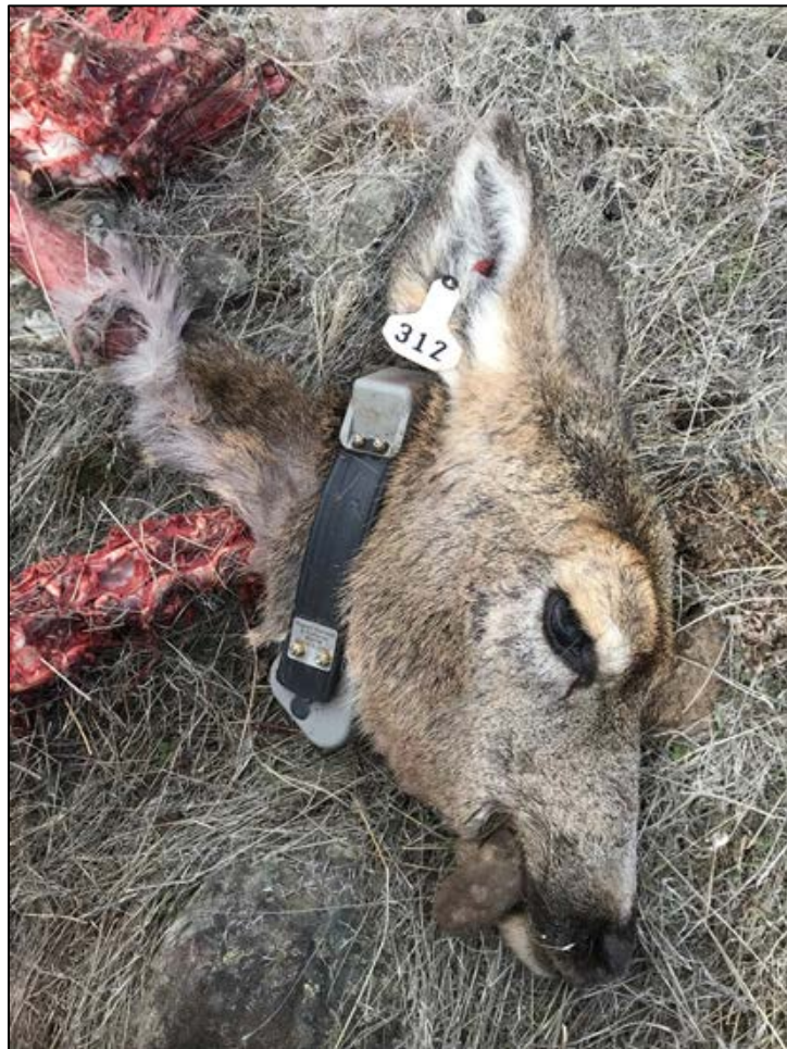
Predation event very close to the same type of mortality location last year

Conflict Specialist Wetzel recovered several radio collared deer mortalities. Most were cougar predation events in the same locations where other collared deer had died in previous years.