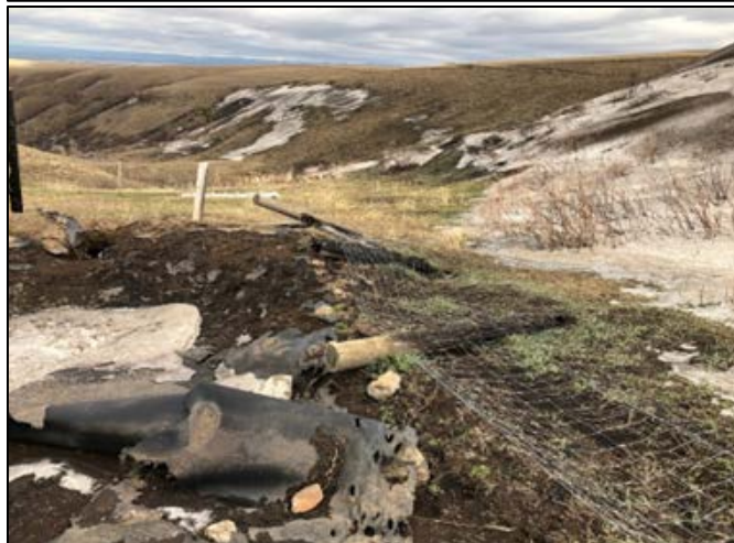
Boss Big-game guzzler collection mat burned after fire