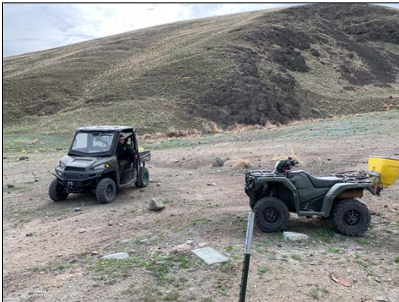
Hell's Kitchen three-acre restoration project