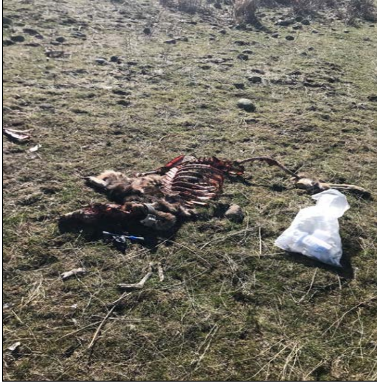
Another collared deer mortality, again very close to a location of one last year

Bald Eagle Sighting: While checking an elk fence crossing, Conflict Specialist Wetzel observed a bald eagle showing signs of illness or injury. The eagle was still active and will be checked again to determine if it needs to be brought to a rehabilitation facility.