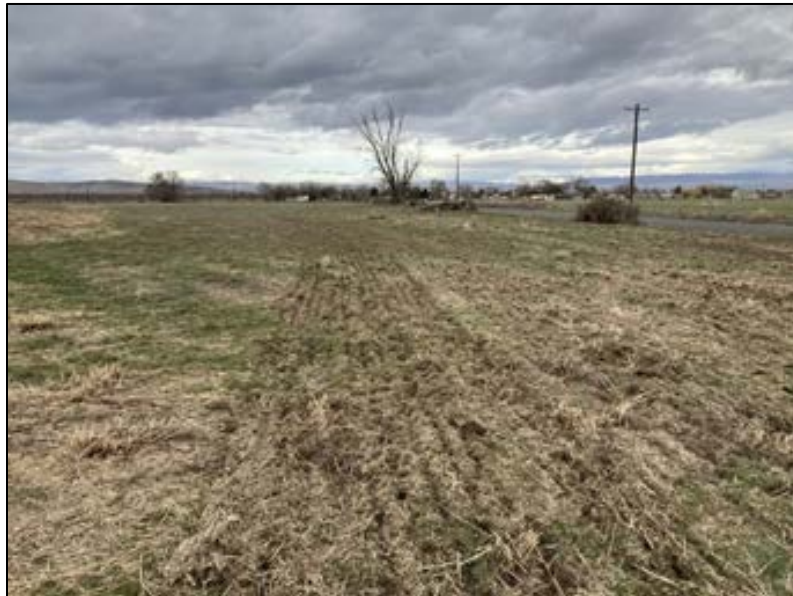
Seeded rows using no-till method