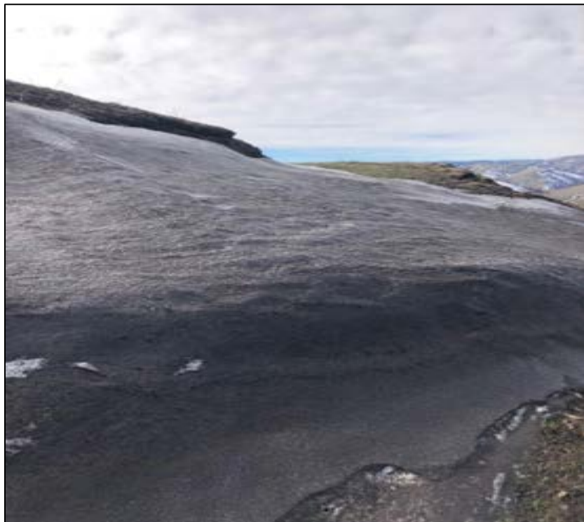
Waist-high snow drift across the road to an upper field. Black color is soot and dirt being blown around from last summer's Lick Creek Fire