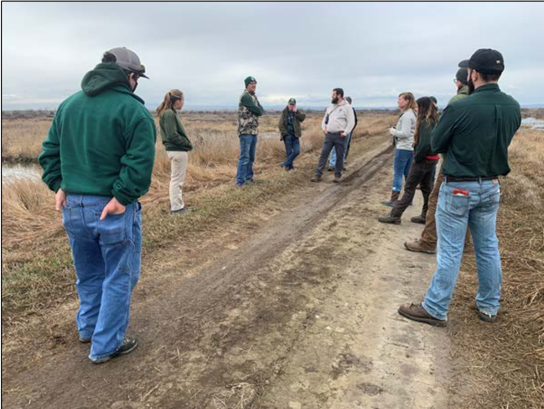
Region 3 Sunnyside Wildlife Area managers discussing wetland management