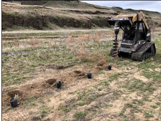
ASV with auger attachment used for shallow holes to plant sagebrush

Sagebrush Restoration: Sunnyside Snake River Wildlife Area Manager Kaelber and Assistant Manager Rodgers have been busy planting Sagebrush within the Esquatzel Unit. A fire in the fall of 2020 burned most of the sagebrush in the unit. Approximately 2,500 gallon-sized plants will be planted using a skid steer ASV with auger attachment.