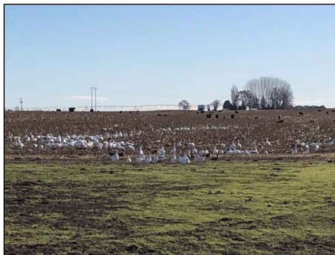
Snow geese and whitefront geese foraging near the Windmill Ranch headquarters

Waterfowl Viewing: Waterfowl are very easy to find within the Sunnyside, Windmill, and Mesa units of the Sunnyside Snake River Wildlife Area. Agriculture fields are being utilized by sandhill cranes, snow geese, and white-fronted geese. The wetlands of these units are a great place to observe various duck species like pintail, northern shovelers, widgeon, and mallards.