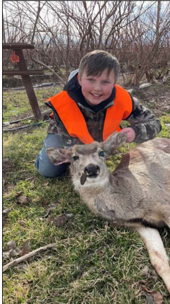
Region 3 Youth Hunter

Pasco Deer: District 4 Wildlife Conflict Specialist Hand continued to coordinate youth hunters for a large tree fruit operation near the Snake River who is experiencing tree damage to a newly planted block of cherry trees. One youth hunter off the Region 3 Youth Permit was able to harvest a deer.