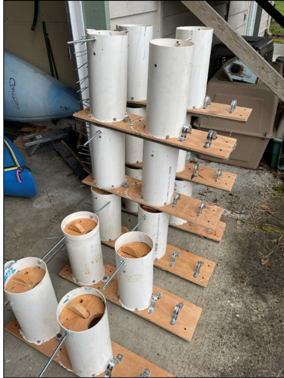
Sixteen purple martin boxes with final modifications ready to be deployed at the Chambers Bay Regional Park