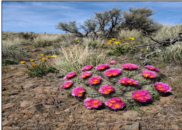
Hedgehog cactus flowering this spring on Brewton Ridge, Colockum Wildlife Area

Plant Viewing: Despite the recent cool weather, people are still accessing the lower elevations of the Colockum to view flowering native plants. Some are especially showy, such as the snowball or hedgehog cactus shown below.