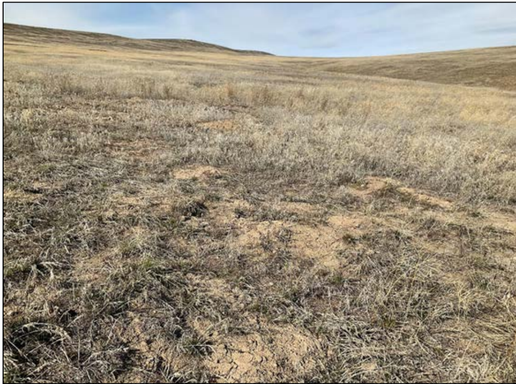
Bull Pasture Field beginning restoration work. Starting chemical fallow for seeding Fall 2023