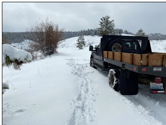
Access road to a Colockum Creek Prescribed Fire Unit

Colockum Creek Prescribed Fire Project: The WDFW Prescribed Burn Program Crew members were scheduled to arrive on the Colockum Wildlife Area the week of April 11, but a late season snowstorm changed the plans. Crews were planning on freshening up fire breaks and start laying water lines in preparation for this spring burn treatment. Twelve inches of wet snow will delay this project.