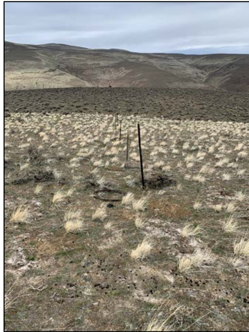
A section of fence on the Whiskey Dick that is down with the material yet to be removed