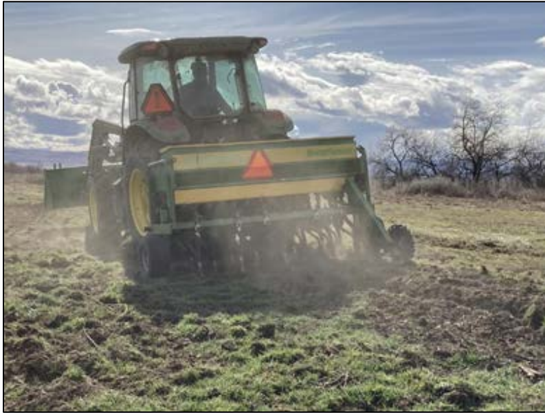
No-till seed drill

Sunnyside Native Grass and Forbes Seeding: Assistant Manager Ferguson and Natural Resource Technician Wascisin have been busy seeding mixes of native grass and forbs into areas that have been infested with kochia, teasle, poison hemlock, knapweeds and other invasives in recent years. Using a no-till seed drill borrowed from the Klickitat Conservation District, the two have seeded approximately 50 acres over the past couple of weeks. With recent spring rains, staff members hope to get the grasses growing and follow up with a broadleaf weed treatment when the invasives begin growing back.