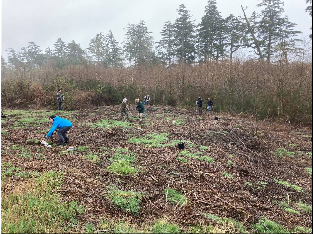
Planting the Elk River Unit - Bechtold