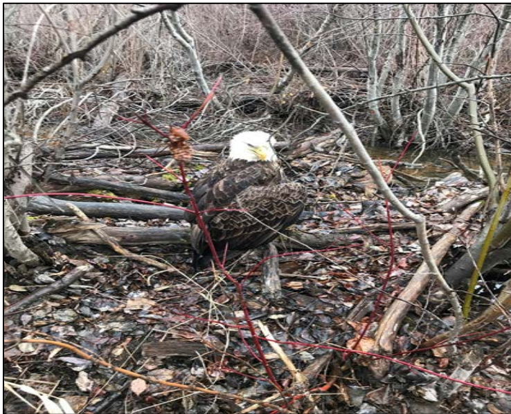
Eagle with signs of illness, but still head up and alert

Bald Eagle Sighting: While checking an elk fence crossing, Conflict Specialist Wetzel observed a bald eagle showing signs of illness or injury. The eagle was still active and will be checked again to determine if it needs to be brought to a rehabilitation facility.