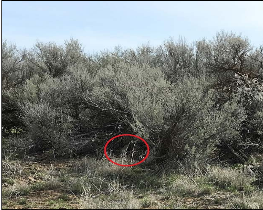
Washington ground squirrel hiding under a sagebrush in one of District 2 survey grids

Washington Ground Squirrels Surveys: Biologists Atamian and Lowe started the first set of surveys of the 18 squirrel grid cells in District 2. Each grid cell is 400m by 400m and has 10 transects spaced 40m apart running North to South or East to West. Transects are walked until at least one squirrel is heard/seen or an active burrow is detected. If no squirrels are detected, the grid cell is surveyed once more. These surveys are conducted every five years.