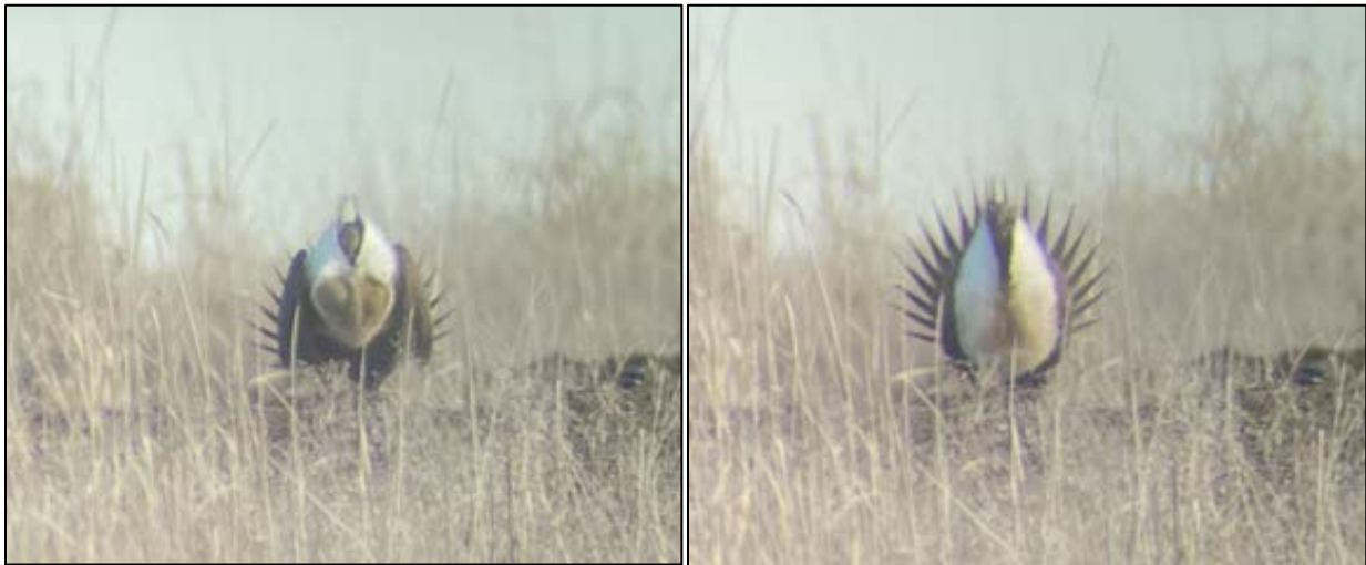
Male sage grouse dancing on lek in Lincoln County

Prairie Grouse Lek Surveys: Biologists Atamian and Lowe are conducting annual sage and sharp-tailed grouse lek surveys and searches. Currently there is still one active sage grouse lek in District 2, but only two males have been observed so far. Two sharp-tailed grouse leks have birds dancing already. Other leks are not showing much activity, but it is still early in the season for sharp-tails.