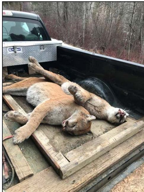
Two cougars recovered from bottom of cliff after natural mortality event