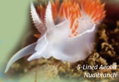
5-Lined Aeolid Nudibranch

36 Long Island: One of the best wall dives in the Pacific Northwest is found on its south side. Its steep, current-washed slopes are covered with strawberry anemones, sponge, barnacles and invertebrate life of every hue. Overhangs and a cave are found deeper. Nearby Whale Rocks, or the south side of Iceberg Point, offer boulder-strewn terrain for a second dive.