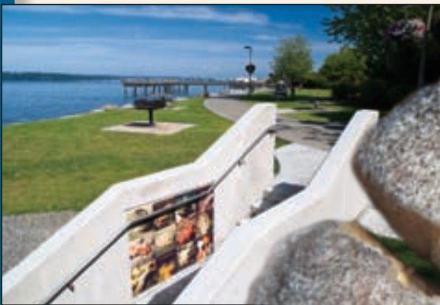
Les Davis Marine Park

17 Les Davis Marine Park: (MPA) Les Davis has been improved and developed for divers in a convenient, urban location along Tacoma's Commencement Bay. The site consists of large slabs of hollowed concrete roadway gathered in large piles from shallow to deeper depths. Be sure to carry a knife, as large amounts of fishing line can be found there. Do not swim eastward past the tire reef by the fishing pier.