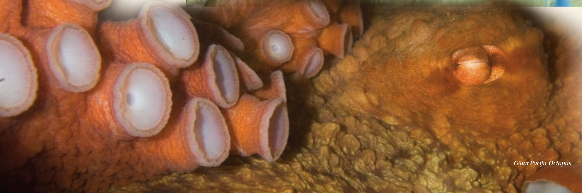
Giant Pacific Octopus

35 Turn Island State Park: Directly offshore from Friday Harbor is this jewel of a park and dive site. Short rocky walls and boulder fields are covered with purple encrusting hydrocoral, sponges and invertebrates that offer homes to many animals. The wall off its east side is a deep drop-off and an exciting advanced drift dive. The site should only be dove at slack, and divers should be aware of very strong currents and rotating downdrafts that can be extremely hazardous.