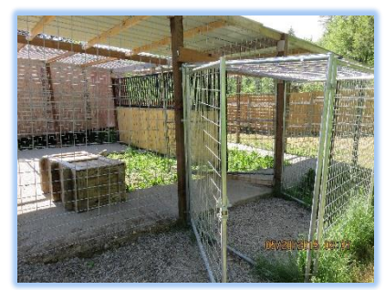
Small-medium mammal enclosure, outside. Center Valley Animal Rescue