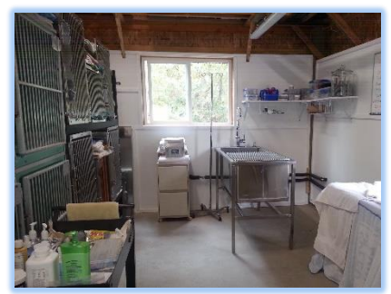
Exam room with restricted care kennels. Discovery Bay Wild Bird Rescue

Wildlife species have a wide array of housing and enclosure requirements for their physical and psychological health. They need everything from safe caging, proper food display, to appropriate enrichment activities. You will need to know housing requirements for many species and groups of animals if you wish to rehabilitate multiple species. Minimum housing requirements are in NWRA's MINIMUM STANDARDS FOR WILDLIFE REHABILITATION 4^{TH} ED listed in Study Guides . You must be particularly good at isolating wildlife from humans.