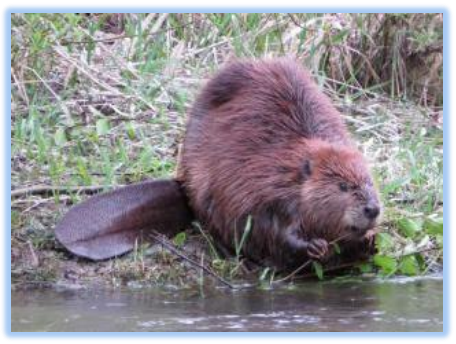
Beaver. Laura Rogers

Because of the deleterious nature of introduced species, eastern