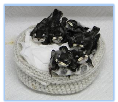
Violet Green Swallows. Featherhaven

Accurate species identification is crucial for raising orphans correctly, knowing which diseases and parasites occur in what species, and for administering the proper medications. Treatments, housing, and diets are often species-specific. You will be asked to record animal admissions to species on your Daily Ledger (for example Song Sparrow not "sparrow"). Some field guides and other natural history books are listed below for your reference. Also consult local colleges and universities and websites such as the <u>UW</u> <u>Burke Museum</u> and bird conservation organizations such as the Audubon Society. You may ask any licensed wildlife rehabilitator for reference materials. One way to start identifying a species is to know if it even occurs in Washington State or the Pacific Northwest.