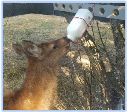
Elk feeding at bottle rack with no human contact. A Soft Place to Land

Imprinting occurs in very young animals at a precise critical period where the animal fixes its attention on and follows the first object or creature it sees, hears, or touches, and becomes socially, and later sexually, bonded, identifying itself as whatever it imprints upon. Malimprinting means imprinting on a species not its own. If the animal imprints upon you, it will believe it is supposed to follow you and do what you do resulting in the animal not recognizing its own species and preventing its release. Imprinting persists into adulthood, is permanent, and cannot be reversed.