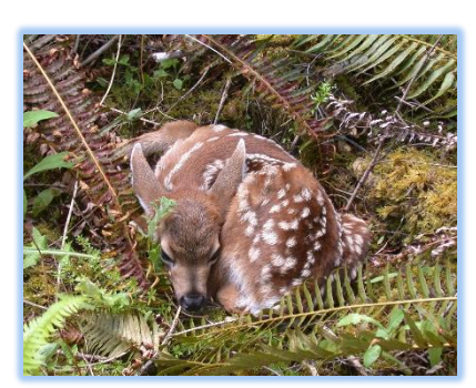
Fawn hiding for protection. It is not orphaned.

Much of your time as a wildlife rehabilitator is spent on the phone educating callers. You will get questions on wildlife identification, wildlife nuisance problems, life history and behavior, laws and regulations, and