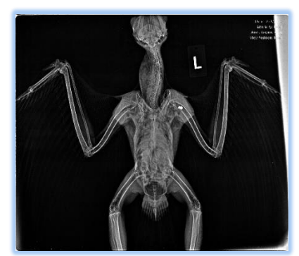
Gunshot Red-tailed Hawk. Blue Mountain Wildlife