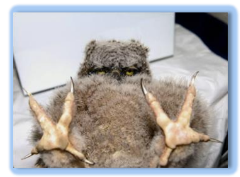
Owlet. Sarvey Wildlife Care Center

The most important aspect of animal restraint and handling is protecting yourself and your staff against injury. Animal restraint classes are offered by several organizations. You may also train with an experienced wildlife rehabilitator. Restraint skills take experience and an intimate knowledge of a species' behavior and anatomy. You or the animal can be injured due to improper technique. Without proper gloves, rabies poles, etc. even small mammals such as squirrels can give serious bites. Unless you are suitably prepared to restrain a given species and protect yourself, you should not accept it into your facility.