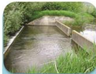
Flood Control Devices