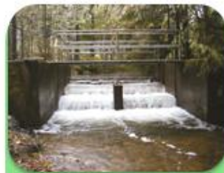
Fish Passage Correction