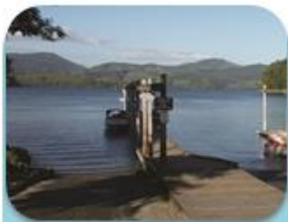
Boat & Equipment Access