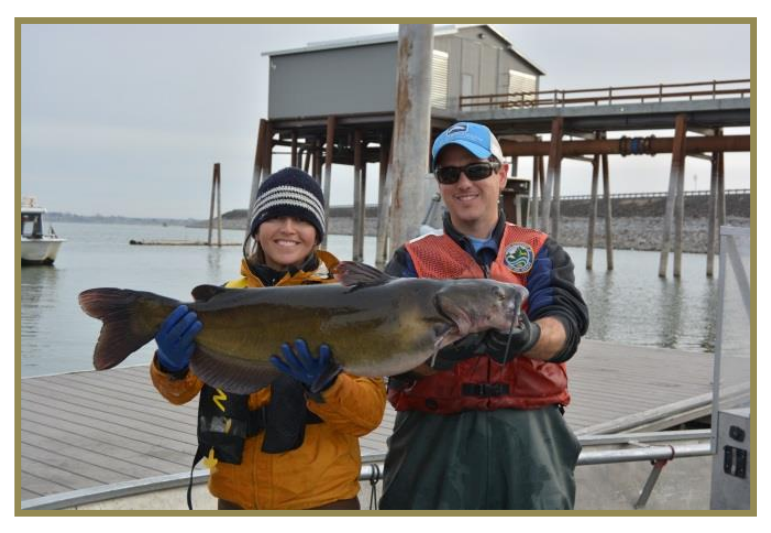
WDFW biologists with a 20lb. Channel Catfish collected on Potholes Reservoir, October 2015.

Potholes Reservoir is one of the most popular fishing destinations in Washington. It is a 28,200-acre reservoir in Grant County, formed by the construction of O'Sullivan Dam across the Crab Creek Valley in 1949. Known as a very popular Walleye fishery, Potholes also hosts a wide variety of other gamefish species including Largemouth and Smallmouth Bass, Bluegill, Black Crappie, Channel Catfish, Rainbow Trout and Bullhead. More recently, large Bluegill and Black Crappie are more frequent in angler catches as well as the occasional 20lb Channel Catfish. Anglers in search of large catfish should focus their efforts on Potholes Reservoir. (Check for Special Regulations)