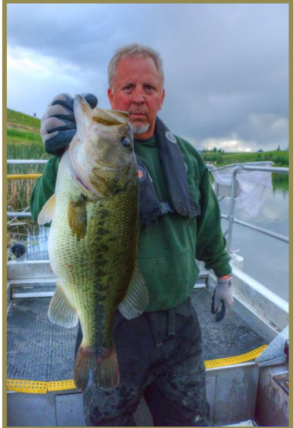
Largemouth Bass collected on Dry Lake, May 2016.

Dry Lake, covering 94 acres, is situated approximately 1.5 miles northeast of Lake Chelan and the city of Manson in Chelan County, Washington. Access to the lake is confined to a small, improved area at the East end, allowing for boat launching. Unfortunately, there are no restroom facilities available on site. Largemouth Bass and Bluegill are the dominant two species in Dry Lake. Bluegill have been observed up to 10.5 inches, while the Largemouth Bass may reach sizes up to 22 inches and over 6lbs. The population of Largemouth Bass is ideally structured to support the production of large Bluegill. Additionally, expect to catch lower numbers of Black Crappie, Yellow Perch, and Brown Bullhead as well. To enhance angler opportunities and improve the size structure of Bluegill, we introduced 1,100 adult Largemouth Bass into Dry Lake during the spring of 2015. Subsequently, in 2017, we successfully negotiated with private landowners, leading to the opening of a new public access point located at the northeast corner of the lake. This access point offers limited parking and allows for the launching of small boats. (Statewide Regulations Apply)